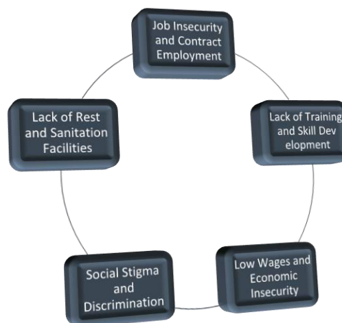
Figure 1 Major Socio-Economic Issues of Waste Management Workers

These waste management workers have low salary and almost no financial security. Also, most of the waste management workers engaged in the city are engaged on contractual basis, which provides them no job security. The workers also face social and psychological issues such as social discrimination and community perception. Also, these waste management workers have no welfare and social security benefits such as health insurance, pension facilities, provident fund, and paid leaves. The working conditions of these waste management workers are also not suitable as they have no proper availability of drinking water, toilet, and rest facilities at the place of their work. These waste management workers also face gender-related issues, especially by the female workers, The female workers often face the issue of workplace safety, Also, the waste management workers of the city have limited access to health care facilities such as health checkups, vaccination, and medical reimbursement facilities.